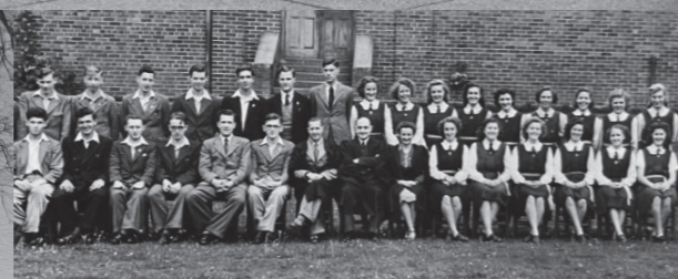
This page (clockwise from top) Maltby Academy (since restoration), 2025 Maltby Grammar School Teachers, 1940s Maltby Grammar School in the snow, 1940s